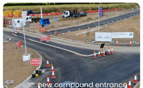
new compound entrance